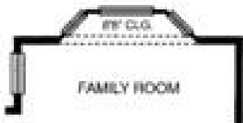
#3 BAY WINDOW AT FAMILY ROOM