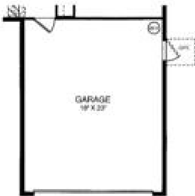
#2 EXTENDED GARAGE 4 FT.

Options shown are not included in the base price of the home. For pricing information, please consult with your salesperson.