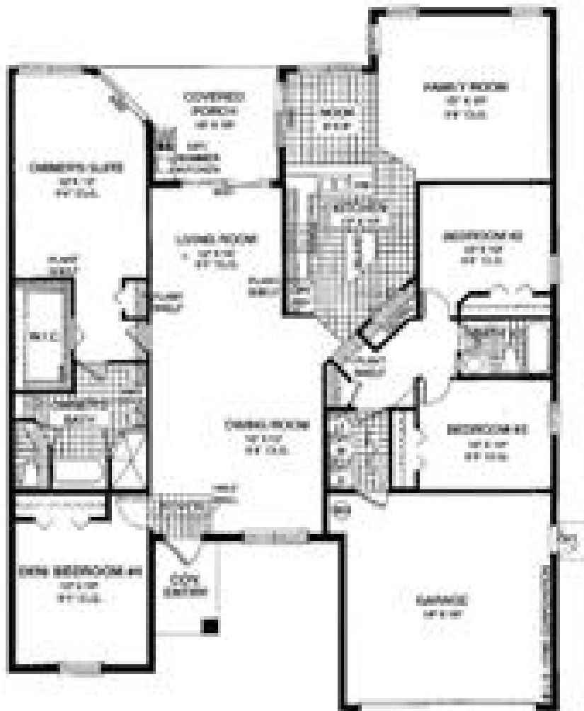
OPTIONAL BONUS FLOOR PLAN ADDITIONAL 286 SQ. FT.