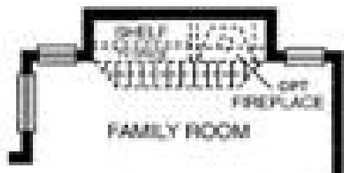
#1 FIREPLACE / MEDIA CENTER AT FAMILY ROOM